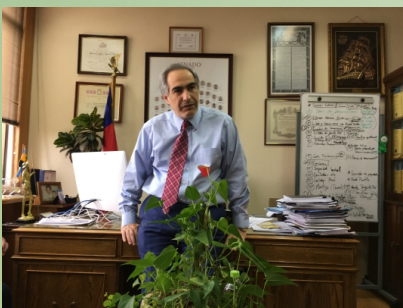
Senator Francisco Chahuán

In December of 2018, we had the opportunity to meet some of Chile's Government officials.