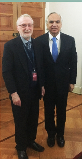
Vice President of Chile Andrés Chadwick