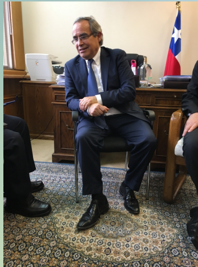
Vice Admiral and Senator Kenneth Pugh